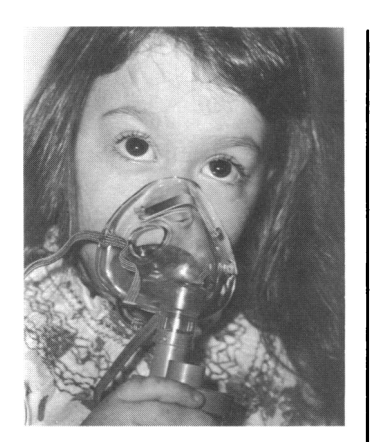
IN THIS ISSUE \bigwedge 475 \bigvee 478

VOLUME 96 NO.5 • SEPTEMBER-OCTOBER 1981 • PUBLISHED SINCE 1878