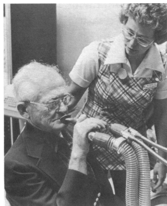
Cover: Routine spirometry is performed on all patients in Wisconsin's decentralized rehabilitation program for patients with chronic airway obstructive disease. Preliminary results are reported on pages 315-318.