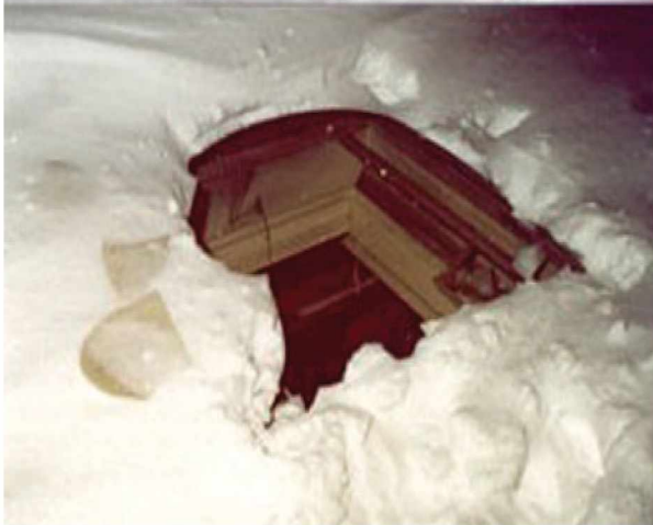
Figure 1. Snow-covered 3-foot-square skylight.

The skylight did not have a protective screen, cover, or guarding around it [Wisconsin Department of Health and Family Services 1999].