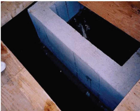
Figure 2. Unguarded floor opening.

A 39-year-old, self-employed residential construction contractor died after falling through an unguarded floor opening and onto the concrete footing 10 feet below (Figure 2). He was framing the second floor with two other workers and was in the process of holding a level to the gable end of the second-floor master bedroom when