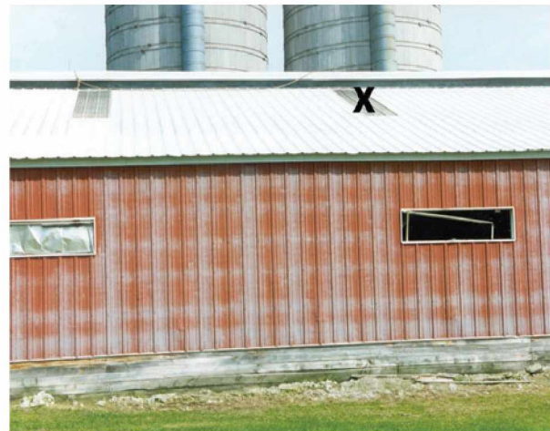
Figure 3. Fiberglass panel on metal roof (marked with an X).

A 62-year-old farmer died from injuries sustained when he fell through a corrugated fiberglass panel used on the roof of a pole barn to let light into the building (Figure 3). On the day of the incident, the farmer drove a tractor equipped with a front-end loader next to the barn. He used the loader bucket to climb onto the roof. He walked up the slope of the roof until he reached a rope tied into the roof vent. Evidence suggests that he held the rope in one hand as he pushed snow off the roof. He stepped onto a snow-covered 3- x 10-foot corrugated fiberglass panel that broke, causing him to fall approximately 16 feet to the concrete floor below. The fiberglass panel had not been guarded or marked with a warning to indicate that it covered a hole [Minnesota Department of Health 1994].