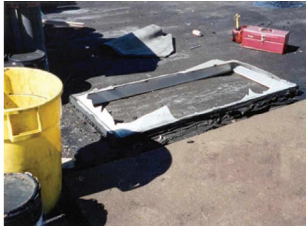
Figure 4. Rectangular skylight after it had been removed from the roof and placed on the ground.

A 14-year-old male laborer died from injuries he sustained when he fell through the lens of a 56- x 24-inch, curb-mounted skylight to a concrete floor approximately 12 feet below (Figure 4). Along with several other day laborers, the victim and his 16-year-old brother had been hired by a roofing contractor on the day of the incident to pull up and remove built-up roofing materials from the flat roof of a one-story wholesale florist shop. The victim had been working for approximately 15 minutes pulling up roofing materials by hand when he fell back onto a skylight lens that broke under his weight. The skylight did not have a protective screen, cover, or