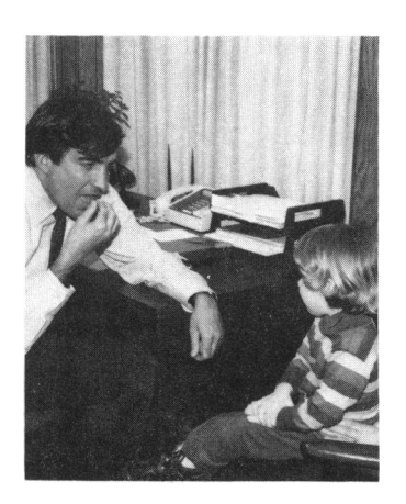
IN THIS ISSUE △ 357 ▼ 403