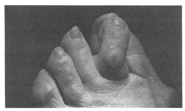
Second toe overlaps the great toe as a result of a severe form of rheumatoid arthritis, a painful and sometimes disabling condition

as well as periodic screening examinations of such patients. Prompt medical or surgical (and rehabilitative) treatment provided by the podiatrist can prevent further damage to the feet and improve basic foot function.