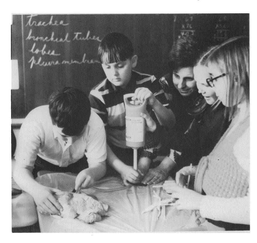
Group experiments with lung function as boy mans air pump

The project involves parents and other members of the family. Initially, letters or other materials prepared by the students are sent home to acquaint parents with the project and its goals. As