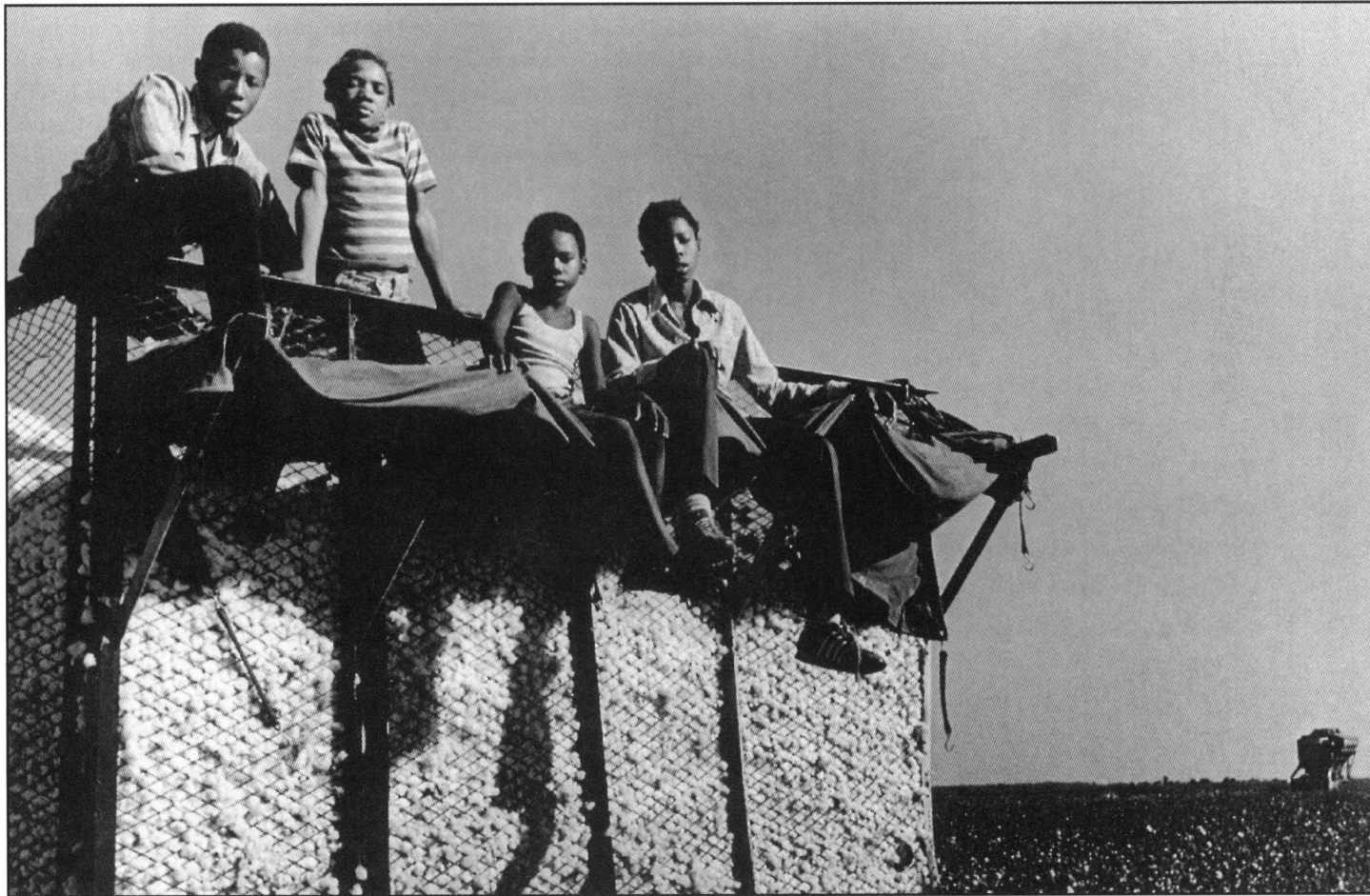
Children prepared to unload a cotton harvester. Bolivar, Mississippi. ▼