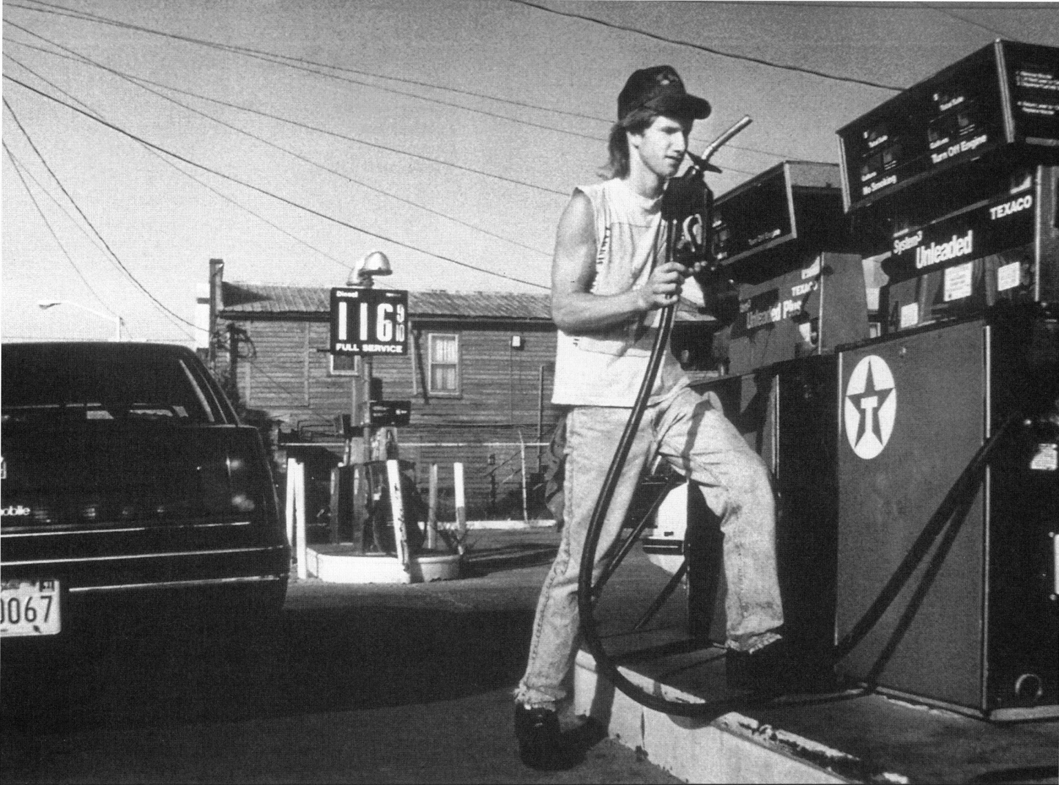
▲ This gas station attendant was hired at age 16. The legal age for pumping gas is 18. Crisfield, Maryland.