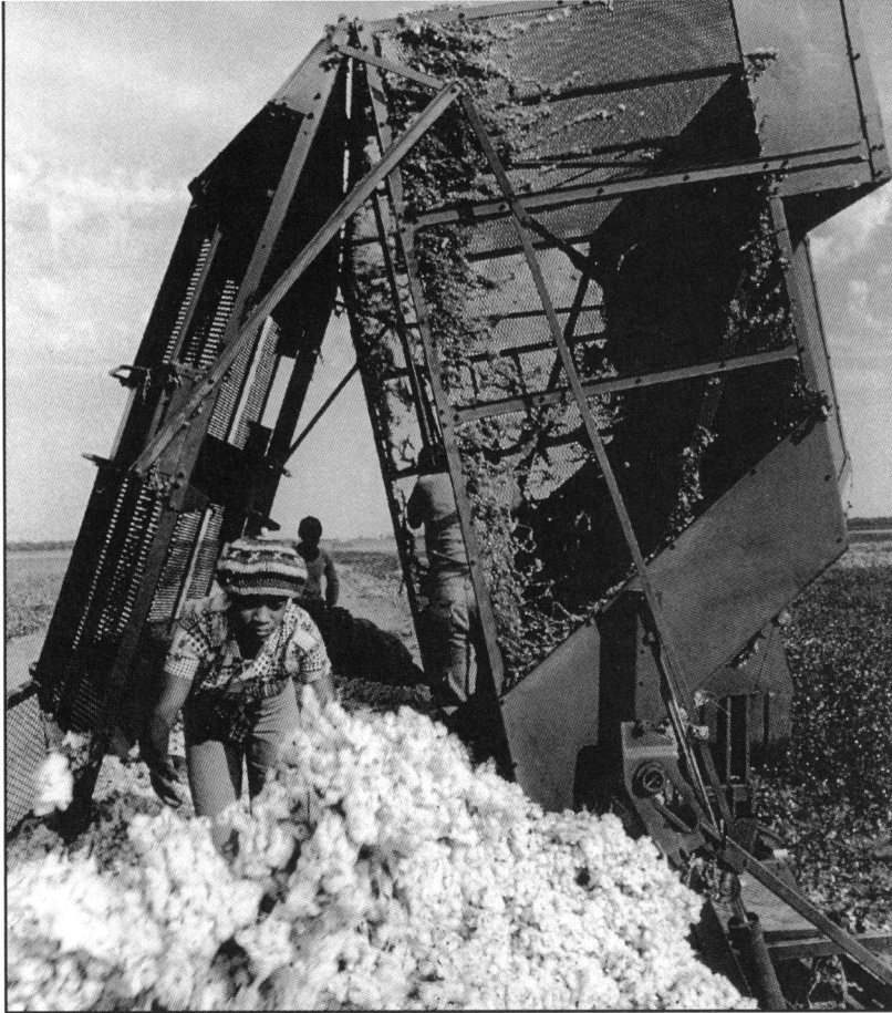
◀ Children employed unloading cotton harvesting machinery. Bolivar, Mississippi.