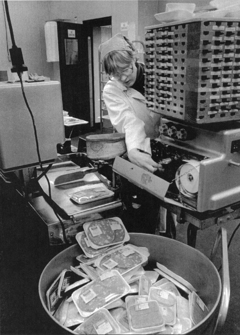
◀ An underage supermarket meat packer unjams store machinery. Queens, New York.

In teaching children responsibility and pride through work, do we pay enough attention to the dangers inherent in what we ask of them? Are they taught how to avoid injury from machinery or physical strain? Do they know the risks of handling solvents, or breathing in fumes or fibers?