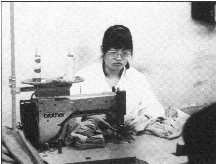
◀ Urban "sweat shops" hire young laborers cheaply, for long hours.