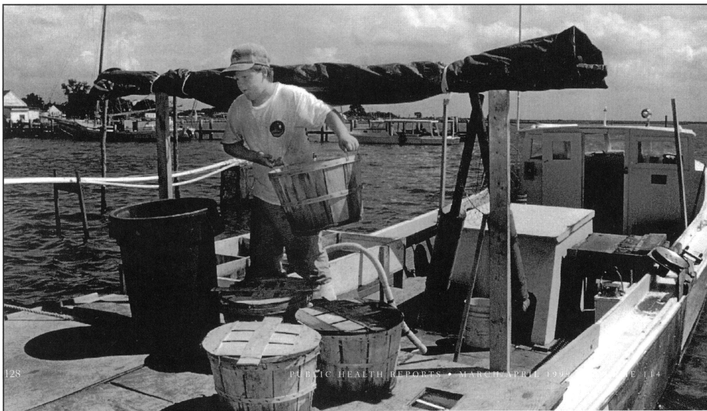
A 13-year old boy unloads the day's crab catch. Deal Island, Maryland. ▼

In teaching children responsibility and pride through work, do we pay enough attention to the dangers inherent in what we ask of them? Are they taught how to avoid injury from machinery or physical strain? Do they know the risks of handling solvents, or breathing in fumes or fibers?