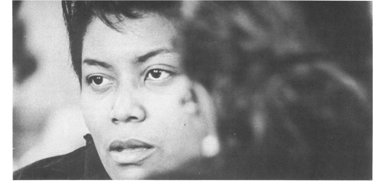
Increasing numbers of troubled young black women are committing suicide

in any way be justified. It simply means that such groups as the Black Panthers should be taken seriously when they call for "Revolutionary suicide—that's suicide motivated by the desire to change the system, or else die trying to change the reactionary conditions" (26). Whether this statement is simply provocative rhetoric similar to the rightwing slogan "better dead than red," or whether it is a valid suicidal threat, remains unanswered.