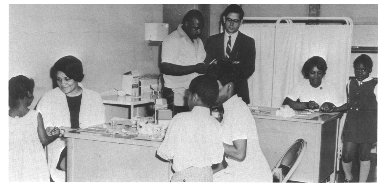
More than 40 percent of the 21,617 children tested had microhematocrits of 36 percent or less

after centrifuging a measured quantity of blood, as in the microhematocrit test.