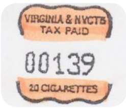
OLD Technology Tax Stamp, Virginia

Within two years of new legislation including encrypted tax stamps, California saw a 37% decline in cigarette tax evasion and increased tax revenue of $110 million. 5