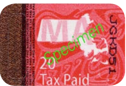
NEW Technology Tax Stamp, Massachusetts

The STATE System contains data synthesized from state-level statutory laws. It does not contain state-level regulations; measures implemented by counties, cities, or other localities; opinions of Attorneys General; or relevant case law decisions for tobacco control topics other than preemption; all of which may vary significantly from the laws reported in the database, fact sheets, and publications.