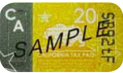
NEW Technology Tax Stamp, California