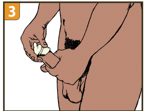
Place condom on penis head.