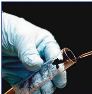
Nanomaterials can behave in unpredictable ways when handled.

Nanomaterials present new challenges to understanding, predicting and managing potential health risks. They may interact with the human body in different ways than more conventional materials, due to their extremely small size. For example, studies have established that the comparatively large surface area of inhaled nanoparticles can increase their toxicity. Such small particles can penetrate deep into the lungs and may move to other parts of the body, including the liver and brain.