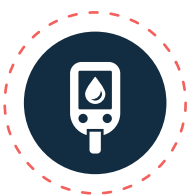
TYPE 2 DIABETES