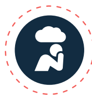
DEPRESSION & ANXIETY

Everyone can benefit from physical activity—your age, ethnicity, shape, and size do not matter.