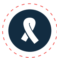
MANY TYPES OF CANCER