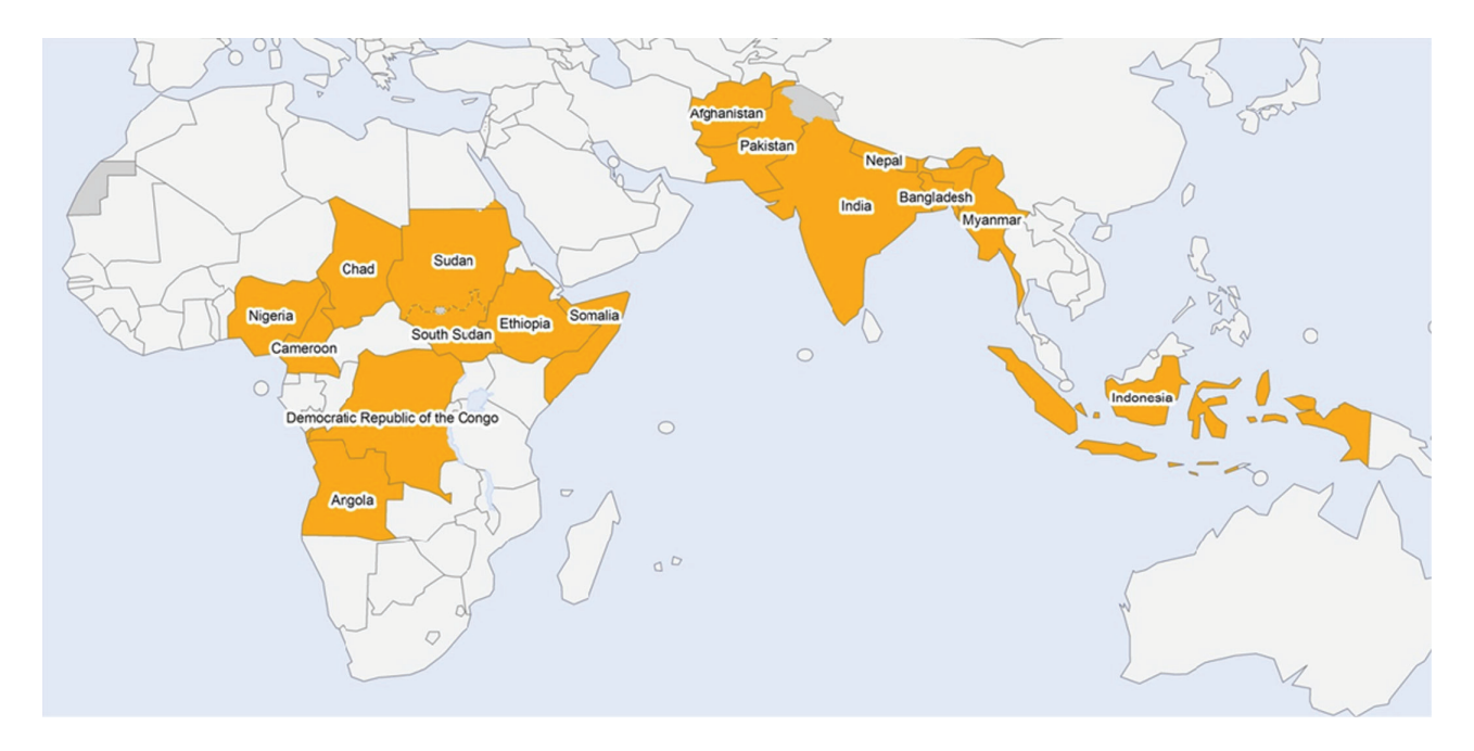
Figure 2. The 16 priority countries for polio transition planning [8].

will be considered by the agencies. The major areas are as follows: how can and should the surveillance networks that are centered on acute flaccid paralysis be expanded systematically for other purposes, particularly for surveillance of vaccine-preventable diseases? [30] What has been the impact of the Stop Transmission of Polio program, and what should its future entail? [31] And how can the social mobilization networks that have been built to engage communities in eradicating polio be most effectively repurposed? [32] Where necessary, the GPEI aims to facilitate this dialogue—so that the agencies' position is known to countries and so that countries' views and plans are taken into account in the agencies' global and regional level planning.