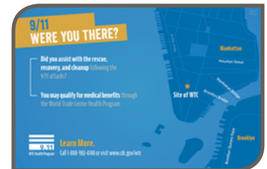
Outreach and Education