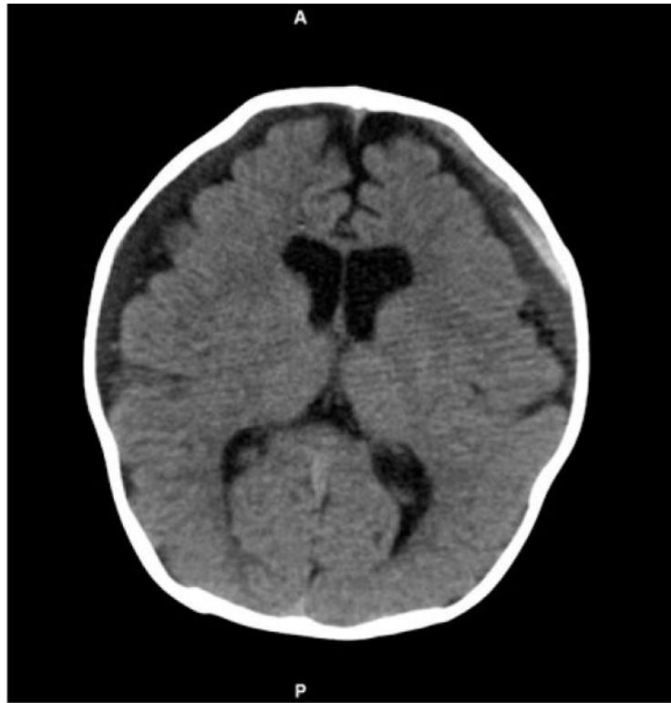
FIGURE 2. Head computed tomography scan of the single subject with type 1 vWD and spontaneous SDH.