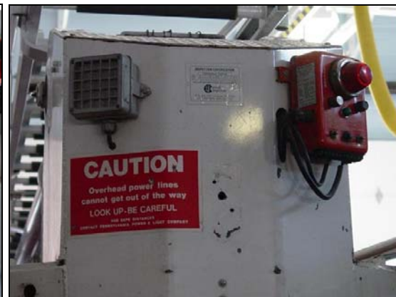
Photos 8 and 9. Example of proximity warning device used on aerial ladder truck at neighboring fire department. Photos left to right – electrical current sensing device, and alarm and control box.