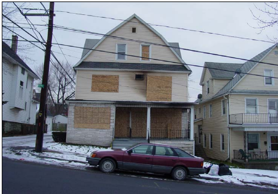
Photo 1. Side-A of three story apartment building (incident scene).

Mention of any company or product does not constitute endorsement by the National Institute for Occupational Safety and Health (NIOSH). In addition, citations to Web sites external to NIOSH do not constitute NIOSH endorsement of the sponsoring organizations or their programs or products. Furthermore, NIOSH is not responsible for the content of these Web sites.