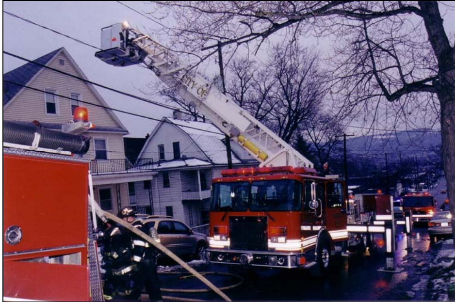
Photo 2. Truck 02 - 2002 model, 85-foot mid-mount, elevating platform.