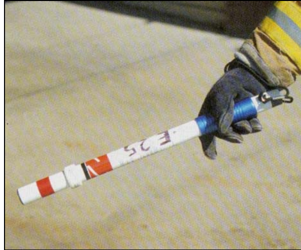
Photo 7. Alternating current detector.