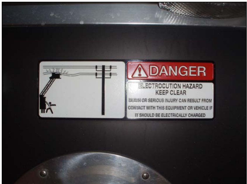
Photos 3 and 4. Shown here are two of the four warning signs affixed to Truck 2.