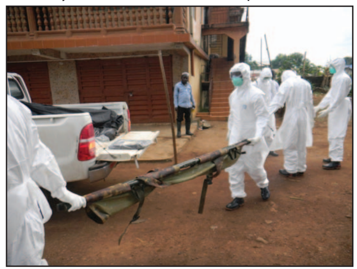
FIGURE 2. A burial team preparing to collect another body and transport it in the back of truck along with eight other bodies that had already been collected — Sierra Leone, September 2014

During direct observation of burial teams over 3 days in the two Western districts, the homes of only two of 22 persons who had died had been visited by a case management team before the burial team arrived to remove the body. In addition, of 22 bodies collected by burial teams, a swab specimen was collected from only three. The burial team supervisor had to explain to these 19 families that they could either keep the body in a separate room and wait for a swab team to arrive and collect a specimen, then wait for the test result before learning