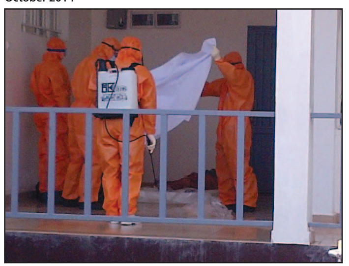
FIGURE 5. A burial team preparing to wrap a body in a Muslim shroud, illustrating the incorporation of a dignified component of a standard operating procedure for safe, dignified medical burial — Sierra Leone, October 2014

and 3) allowing, when possible, burial teams to conduct safe community burials close to the home of the deceased.