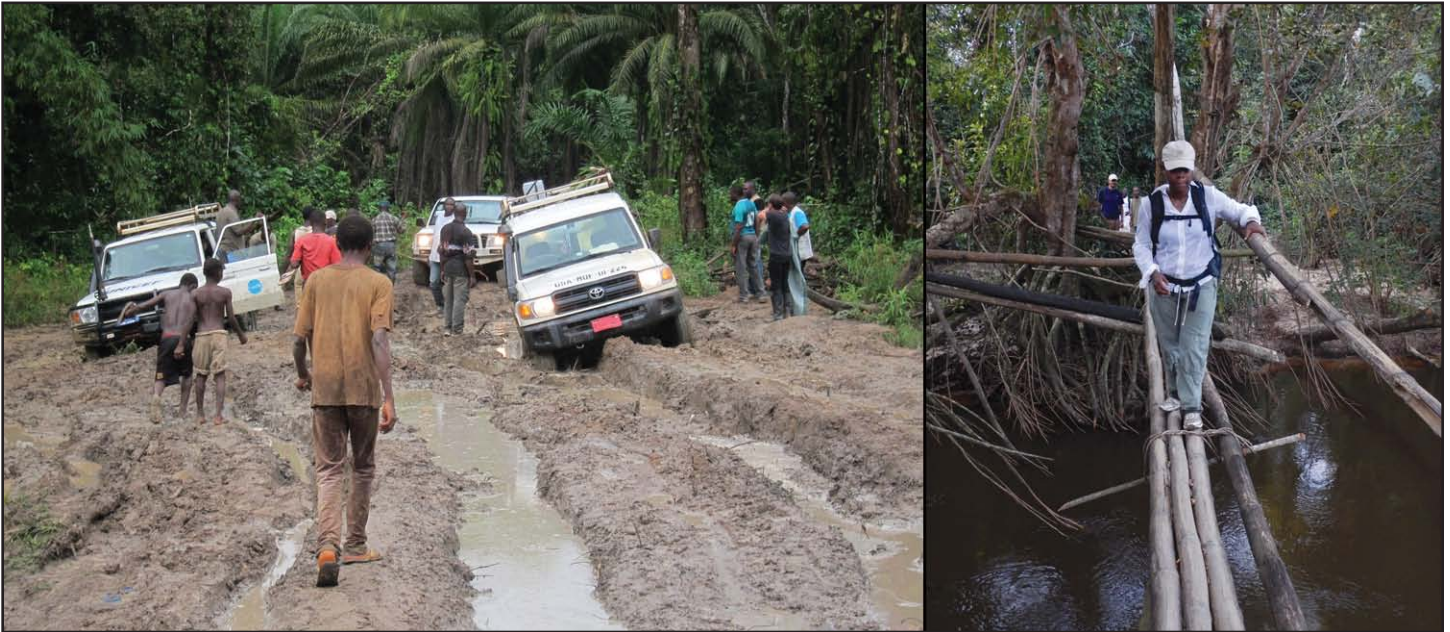
FIGURE 3. Challenges facing Ebola teams traveling to remote communities in Liberia have included impassable roads such as this one on the way to John Logan Town (left) and difficult river crossings such as this one on the way to Bomota (right)