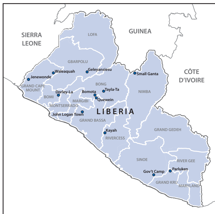
FIGURE 1. Locations of 12 Ebola outbreaks in remote communities — Liberia, July 16–November 20, 2014

who had recently died from Ebola. In Small Ganta, Nimba County, the death and burial of a woman who cared for the index patient resulted in 16 (25%) of the 64 Ebola cases in that outbreak. Although several traditional healers were infected in these outbreaks, no cases in health care workers from public or private health facilities were identified.