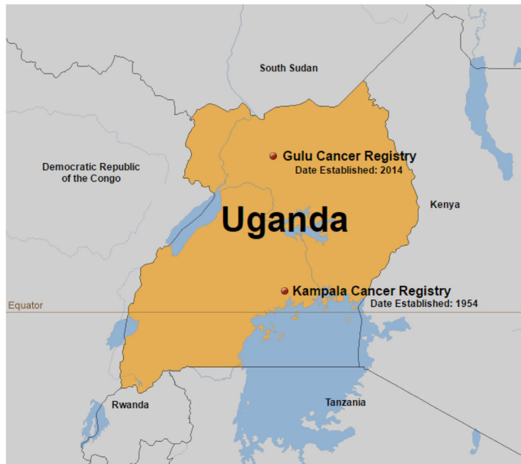
Fig. 1. Uganda Map with Registry Locations.