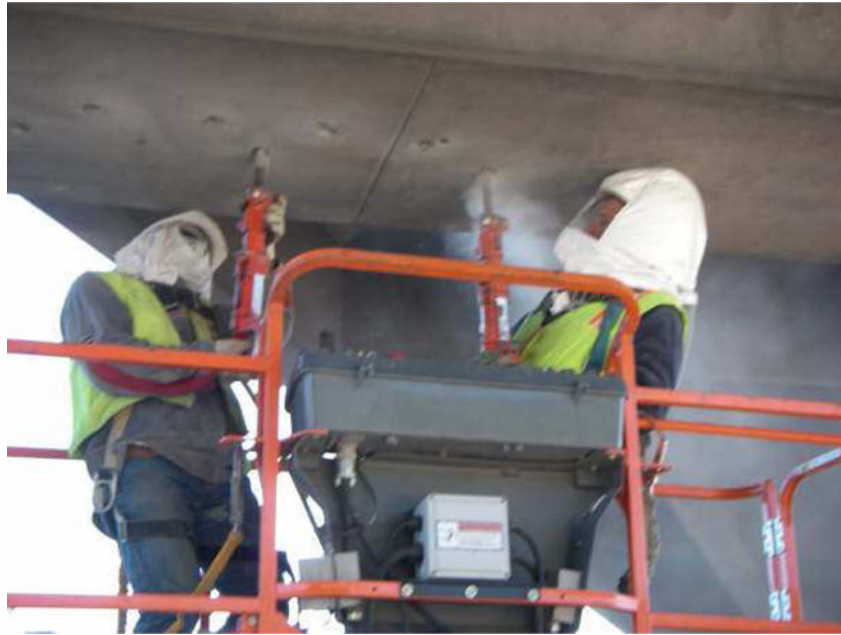
Figure 1. Manual drilling with pneumatic rock drill for structural work.