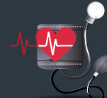
CONTROL BLOOD PRESSURE