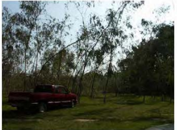
File Name: CombustionPhyto1.JPG Date/Time Taken: 13 Oct 2005 Description: Photograph of phyto-remediation trees at site.