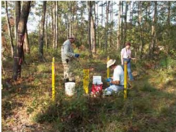
File Name: CombustionMW210S.JPG Date/Time Taken: 13 Oct 2005 Description: Photo of MW210S being sampled.