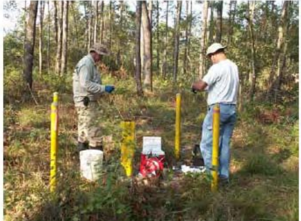
File Name: CombustionMW210Sb.JPG Date/Time Taken: 13 Oct 2005 Description: Photo of MW210S being sampled.