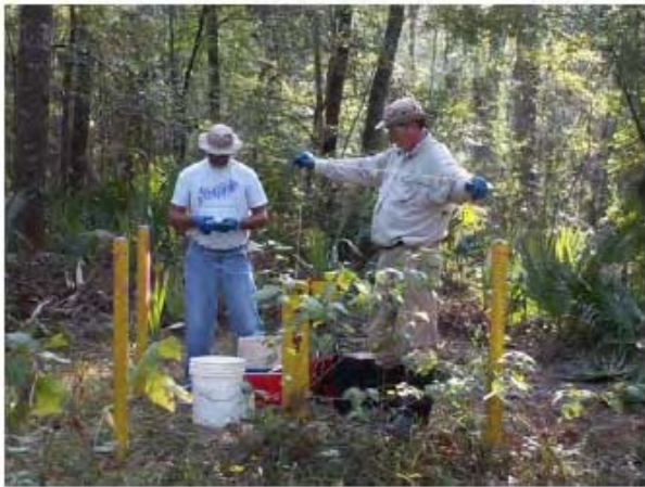
File Name: CombustionMW212Sb.JPG Date/Time Taken: 13 Oct 2005 Description: Photo of MW212S being sampled.