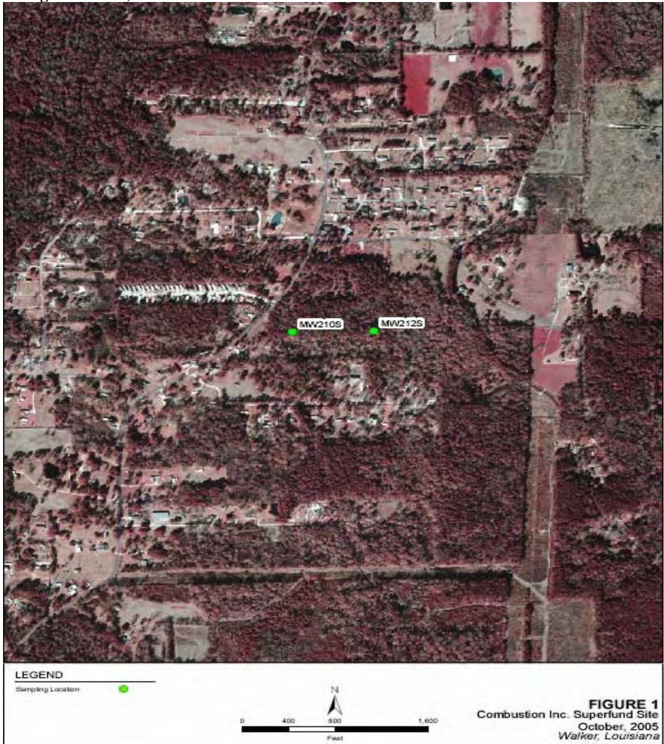
Figure 1: October 2005 groundwater sampling locations, Combustion, Inc. site. Livingston Parish, LA.