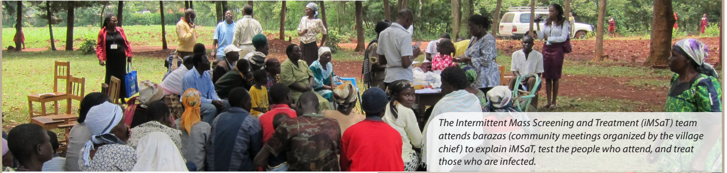
The Intermittent Mass Screening and Treatment (iMSaT) team attends barazas (community meetings organized by the village chief) to explain iMSaT, test the people who attend, and treat those who are infected.

For more than 60 years, the Centers for Disease Control and Prevention (CDC) has been a leader in the fight against malaria since successfully eliminating it in the United States. Building on that success, CDC experts continue to develop and evaluate malaria control interventions to reduce malaria illness and death and ultimately to eliminate malaria globally. CDC's strategic research helped develop and evaluate each of the effective tools now used throughout the world to prevent and control malaria: