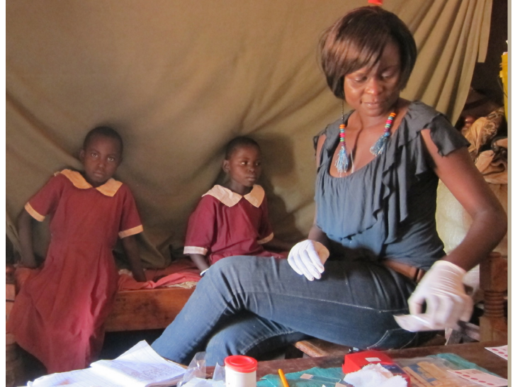
A health worker visits a home to test residents for malaria and treat those infected.

Now, in countries with high malaria transmission where interventions have reached high levels of coverage, the number of people ill or dying from malaria has decreased. Even so, the numbers remain unacceptably high. In many places, success in controlling malaria has changed malaria transmission patterns so that some areas have almost no malaria. In addition, in much of Africa, the mosquito that transmits malaria is not killed or repelled by the insecticides being used, and in Asia, the malaria parasite is becoming resistant to artemisinin, the principal component of the combination treatments that are used to treat malaria worldwide. If the past is an indicator, resistance to these life-saving antimalarials will spread to Africa. Success and resistance are creating a malaria landscape that requires new tools and approaches.