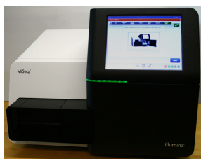
Next generation sequencing

Recognizing CDC's strengths, Congress under the Lantos-Hyde Act directed CDC to "advise the U.S. Global Malaria Coordinator on priorities for operations and implementation research" and "on monitoring, surveillance, and evaluation activities" and "to be a key implementer of such activities." CDC fulfills this role by implementing the U.S. President's Malaria Initiative with USAID and by focusing our expertise to produce critical evidence on new tools and strategies to impact malaria globally.