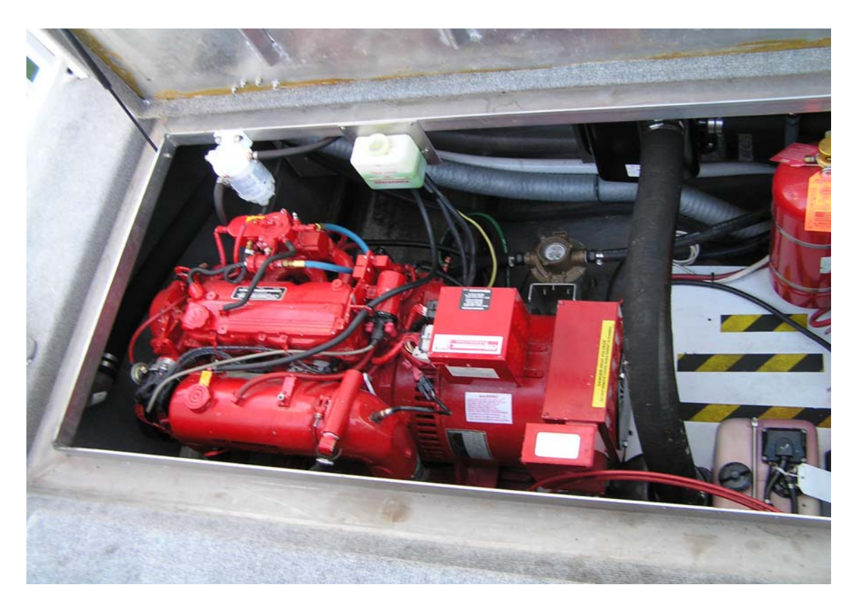
Figure 2. Photo of the Westerbeke Safe-CO generator.