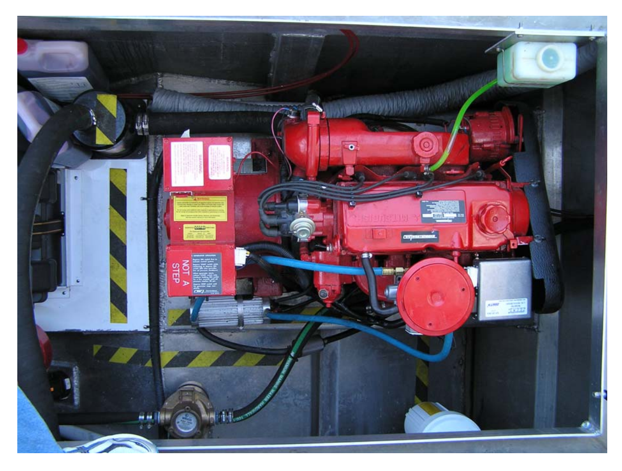
Figure 3. Photo of Westerbeke Generator with Zenith Electronic Fuel Injection kit.