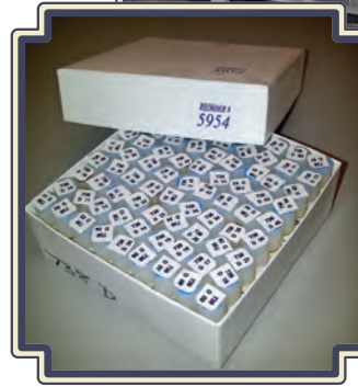
▲ Large racks in a -30° walk-in freezer hold the Specimen Bank samples. ▲ Plastic vials provide long-term protection and are bar-coded for rapid identification.