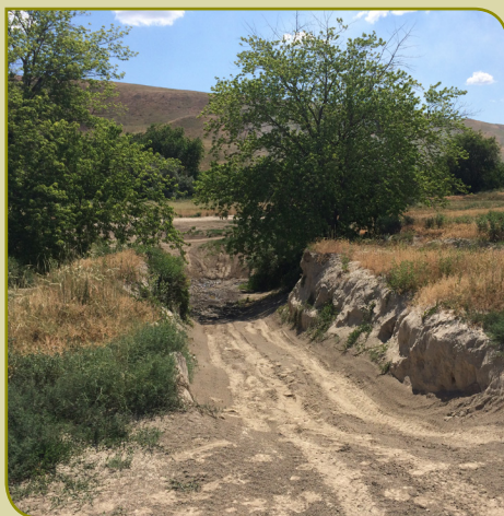
Coccidioides lives in dry, dusty soil. It was recently found in south-central Washington.

Scientists believed that Coccidioides only lived in the Southwestern United States and parts of Latin America until discovering it in south-central Washington in 2013 after several residents developed Valley fever without recent travel to areas where the fungus is known to live. Samples from one patient and soil from the suspected exposure site were analyzed using a laboratory technique called whole genome sequencing and were found to be identical, proving that the infection was acquired in Washington.