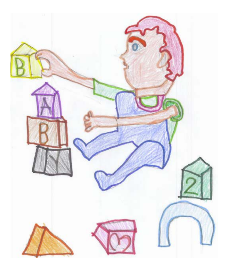
Olivia, Age 8

CDC will work steadfastly in the coming years to advance our science to inform and bolster individuals' actions, support systems-level changes, and train future cohorts of experts to accelerate the prevention of birth defects.