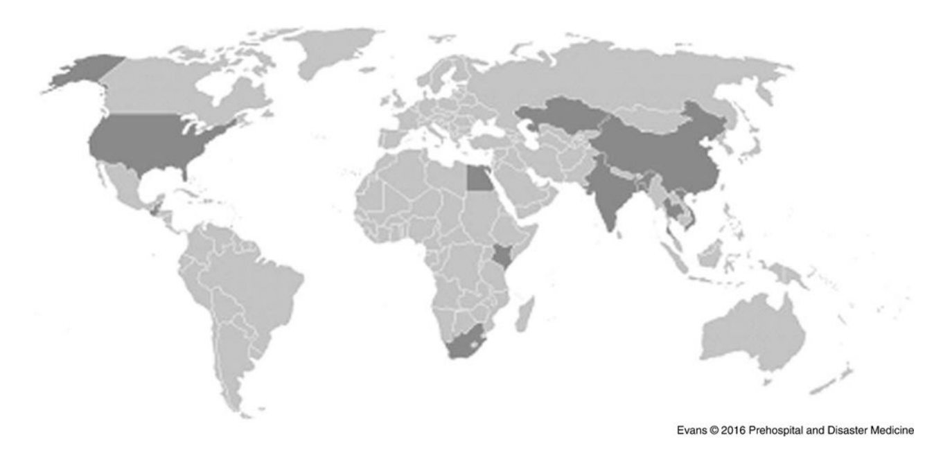
Figure 2. Field Locations for IEPT-sponsored Practica, 2009–2014. Abbreviation: IEPT, International Emergency Preparedness Team.