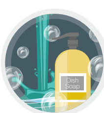
WARM, SOAPY WATER