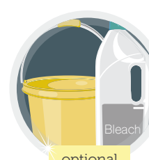
WATER + BLEACH optional