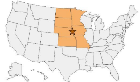
Average annual Injury rate by state among farmers and ranchers, 2011-2014 (per 100 people)

CS-CASH, located in Omaha, NE, serves seven central U.S. states