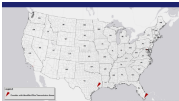
Figure 1: Example of a CDC Interactive Map of Counties with Travel Guidance for Zika

The area recommended for travel guidance should be communicated to the public using terminology and landmarks recognizable to residents and visitors, such as street-level borders, a neighborhood, a zip code area, a city, or a county depending on the geographic extent of transmission. The area should be clearly recognizable by residents and visitors, while best reflecting the routine practices of the local jurisdiction in indicating areas of public health risk, so the population can take appropriate precautions. CDC will indicate areas designated by the state for a travel guidance on a national map because this serves a national public health need.