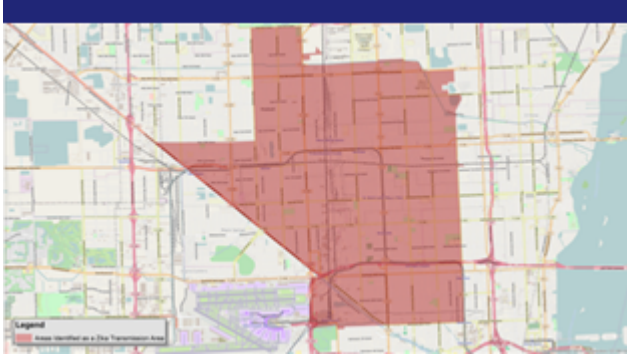
Figure 2: Example High Resolution Map of a State-Designated Travel Guidance Area

Clicking on the county would link to a higher resolution map layer provided by the appropriate state or local health department where the travel guidance is clearly designated. An example of a potential travel guidance area is shown in Figure 2. Links to the state health department would also be provided so the viewer could gather information about specific recommendations made for that area.