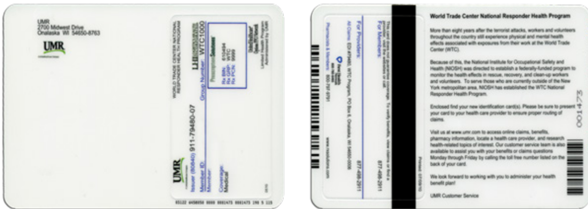
Member ID Card

If you are having a problem filling a prescription, you should ask the pharmacist to call the NPN Case Management department toll-free at 1-877-498-2911 , Monday - Friday, 7am-5pm.