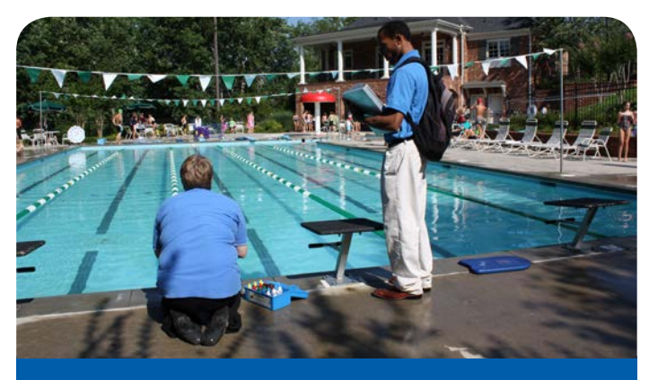
Help keep people healthy and safe by using the MAHC to reduce these health risks

Aquatics sector leaders don't have to wait for a government agency to adopt the MAHC. They can implement key MAHC elements now to start improving health and safety at their facilities.