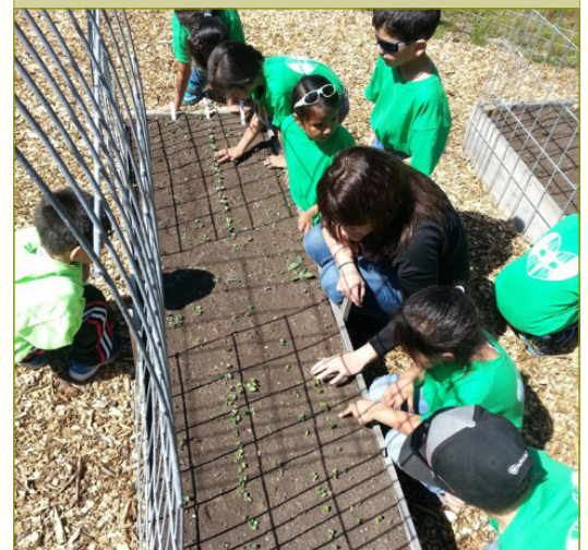
Children in the Confederated Tribes of the Umatilla Indian Reservation Head Start program tend their first outdoor garden and learn the importance of healthy eating.