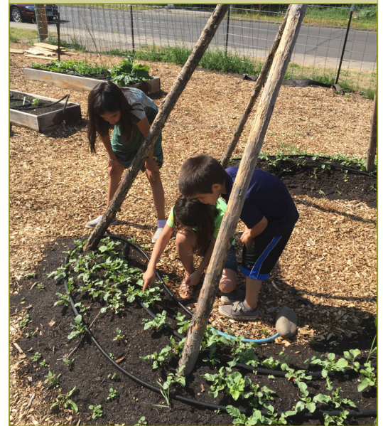
The tipi is a culturally adapted trellis for green beans at the Yellowhawk Community Garden.