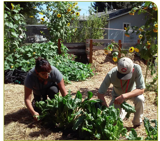
A gardener and helper tend vegetables at the Yellowhawk Community Garden.

The Yellowhawk Health Center of the Confederated Tribes of the Umatilla Indian Reservation is implementing a walking program called Walk the Rez that is modeled after national walking programs and Let's Move in Indian Country. The health center maps out trails and provides information about local landmarks, history, and lifeways of the Umatilla, Walla Walla, and Cayuse people. Participants who use the trails track their steps and submit their tally to the program. A community of sharing has formed as the number of participants enjoying physical activity and learning about their culture has increased.