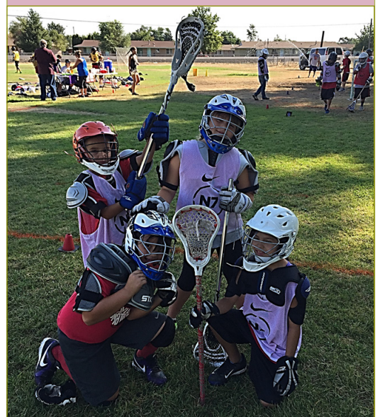
The first-ever lacrosse tournament for the Yellowhawk community, hosted by the Xa'lish Lacrosse Youth Wellness Program.

Eleven TECs serve tribes, villages, and tribal organizations in each IHS area to evaluate GHWIC interventions. They focus on demonstrating tribe and area-level impact. One TEC, the Urban Indian Health Institute, coordinates the national evaluation by providing support and expertise to other TECs, tribal organizations, tribes, and CDC.