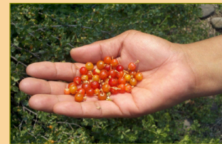
Wild currants from the San Carlos Traditional Apache diet program.

Through GHWIC and other programs, NCCDPHP strives to partner with Native communities