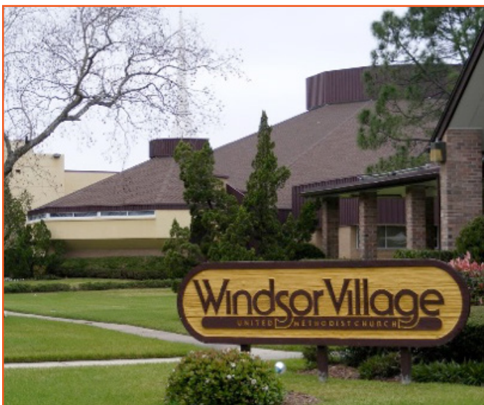
Windsor Village United Methodist Church