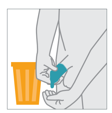
Carefully remove the condom and throw it in the trash.

For more information please visit www.cdc.gov/condomeffectiveness