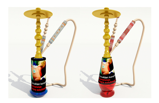
Figure 1. Health warning labels on waterpipes in Turkey.

As with cigarette packages in Turkey, there are two general and one combined health warning labels placed on the waterpipe bowls used for consuming waterpipe tobacco products, covering at least 65% of the principal display area, excluding the bottom (see Figure 1).