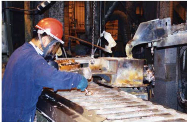
Figure 1. A young man near the beginning of his working life at a lead-acid battery recycling facility.