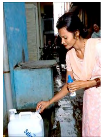
A woman in Delhi treats water using the SWS

To use the SWS, families add one full bottle cap of the solution to clear water (or 2 caps to turbid water) in a standard sized container, agitate, and wait 30 minutes before drinking.