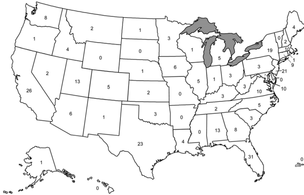
Fig. 2. USA map showing frequency distribution of electronic news media “white powder” incidents by state, 2009–2011 (n=297)