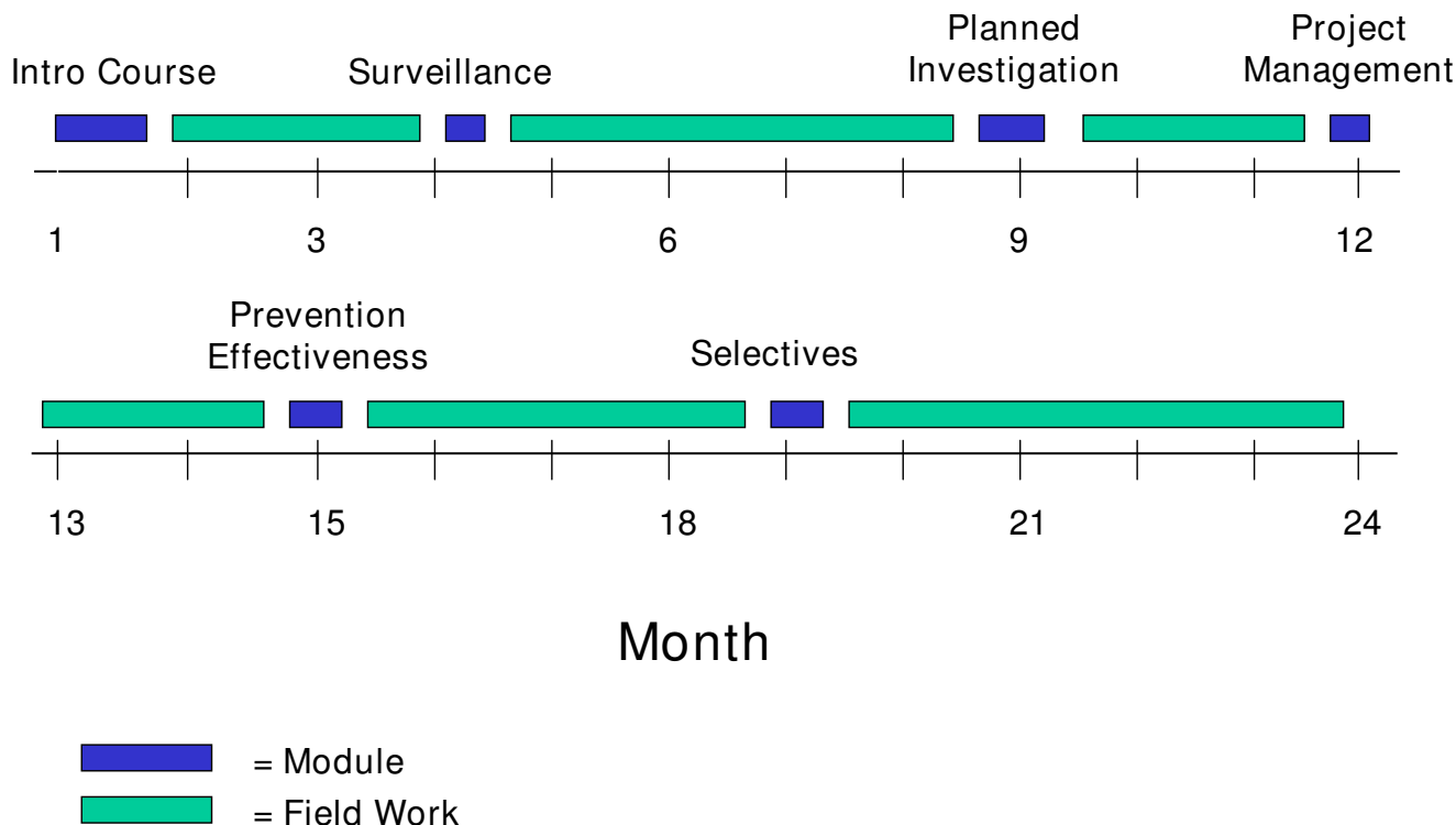
Figure 2 General time line for modules conducted by the Central American Regional FETP (advanced tier).

increasingly taking ownership of their respective national FETPs and negotiating with local universities. Costa Rica was the first country to achieve accreditation of its national FETP by a local university, and similar initiatives are ongoing in El Salvador and Honduras. Because of this transition, as of 2007 we no longer speak simply of one regional programme. Rather, there is one national programme (Guatemalan FETP) that reaches out regionally by accepting trainees from other countries (some with less mature programmes). In addition there are several countries that together with Guatemala have formed a regional coalition of independent, mutually supporting national FETPs. In addition to planning joint initiatives, they support each other through sharing materials and experiences.