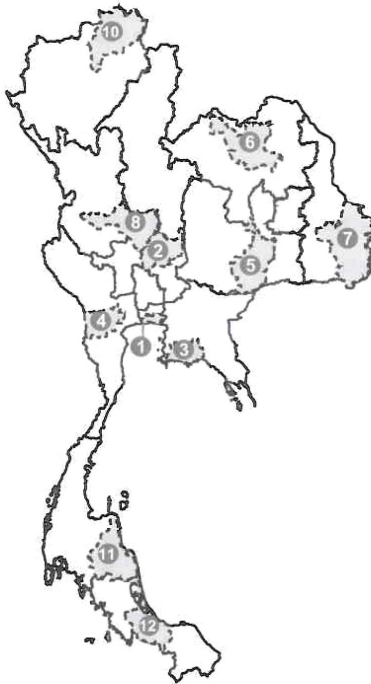
Fig 1. Sampled provinces containing 23 public hospitals included in the survey in 11/12 health administration regions that oversee PMTCT program implementation (dark line indicates boundary of each region and grey highlight indicates provincial area).