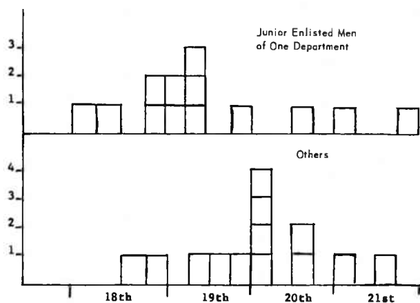
DATES OF ONSET BY 6-HOUR PERIODS

Of particular interest is the fact that 2 of the 5 epidemic investigators subsequently developed the illness. They were the only 2 of the investigating team to enter the berthing spaces. One developed symptoms 12 hours and the other 19 hours following entry of the ship.