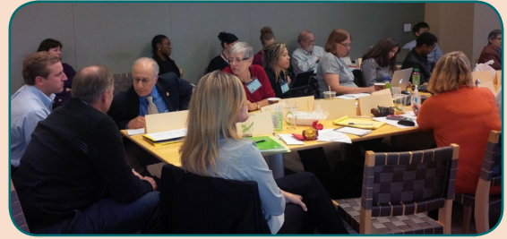
Kick-off meeting for the Multi-Site Clinical Assessment of CFS study.

The branch develops and evaluates clinical and public education programs to decrease morbidity associated with CFS. It incorporates behavioral translational research to study, design and evaluate CFS education activities and applies communication and education theories to outreach activities. CVDB strives to maintain a two-way relationship with stakeholders. Based on feedback from advocates and the research community, CVDB hosts a CFS Patient-Centered Outreach and Communication Activity (PCOCA) conference call providing program updates, presentations by CFS experts, and a communications platform for the CFS community. The branch develops continuing education (CME, CNE, or CEU) through web-based, self-study courses available on the CDC website. CVDB also works with the Center for Advanced Professional Education (CAPE) at UC Denver to develop educational CFS patient curricula for medical schools.