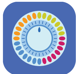
Birth Control Pill