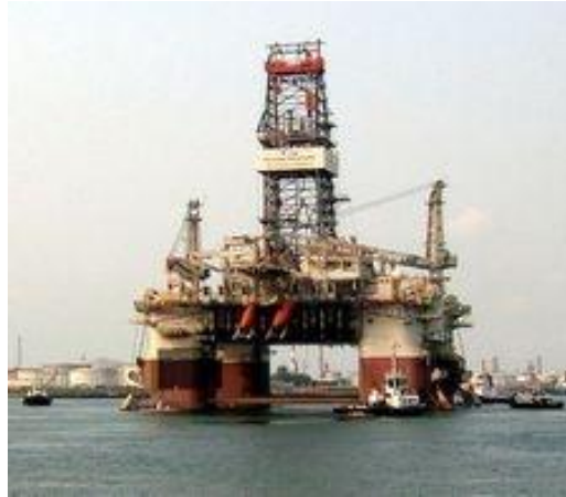
Figure 1. GSF Development Driller II.

mud conditioning (mixing, cleaning, recirculating) and well-control equipment. The DD II was not involved with oil collection from the damaged BOP and at the time of the NIOSH evaluation was operating in drilling mode, along with DD III. The water surface distance between the DD II and the Discoverer Enterprise was about 2,400 ft; the distance to the DD III was about 2,500 ft. One hundred sixty-seven people were on board the DD II during the NIOSH evaluation. This included 95 Transocean workers, 21 Transocean third party workers, and other personnel with the client (BP) or client third party employers.