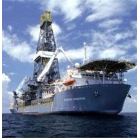
Figure 2. Discoverer Enterprise.

One hundred eighty-six people were on board during the NIOSH evaluation. The largest numbers of workers were with Transocean (93 workers), Schlumberger (22), ART Catering – [quarters operation] (19), Oceaneering – [Remotely Operated Vehicles on the ocean floor] (13), and BP (8).