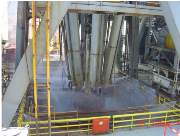
Figure 4. Discoverer Enterprise moon pool main deck.

Airborne contaminants and atmospheric hazards monitored on the vessels by BP were: volatile organic compounds (VOCs), LEL (calibrated for methane), percent oxygen, hydrogen sulfide (H 2 S), carbon monoxide (CO), benzene, sulfur dioxide (SO 2 ), and particulate matter less than 10 micrometers (µm) aerodynamic diameter (PM 10 ). These latter two contaminants were measured for source control vessels (Discoverer Enterprise and Q4000) that were burning gas or gas and oil as part of containment or production activities. Air monitoring for VOCs was conducted using AreaRAE Steel (Rae Systems, San Jose, California) photo-ionization detectors (PID). An UltraRAE (RAE Systems, San Jose, California) PID monitor, which was specific for benzene, was used when elevated VOC levels were detected. This unit