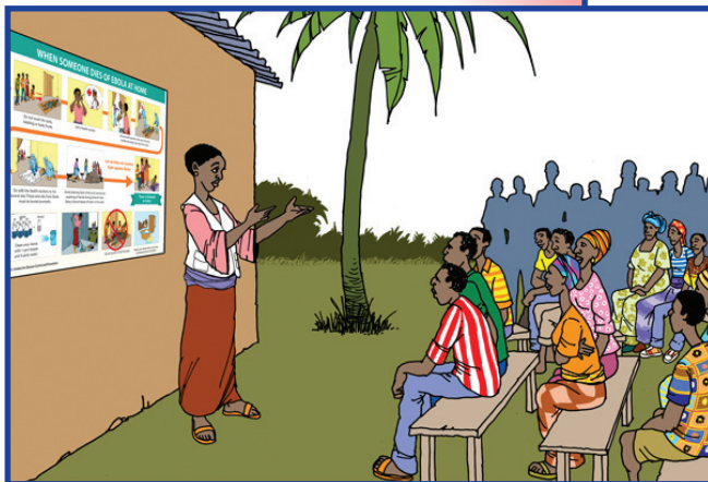
I ka kabila dmqm