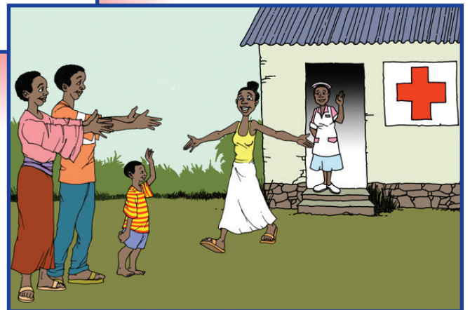
Ni an ye xogon dmqm an bq niw tanga! An ka xogon dmqm ka ebola kqlq!