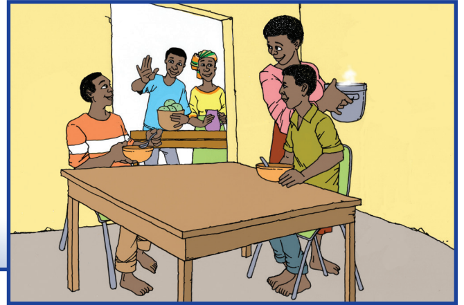
I sigixogonw dmqm