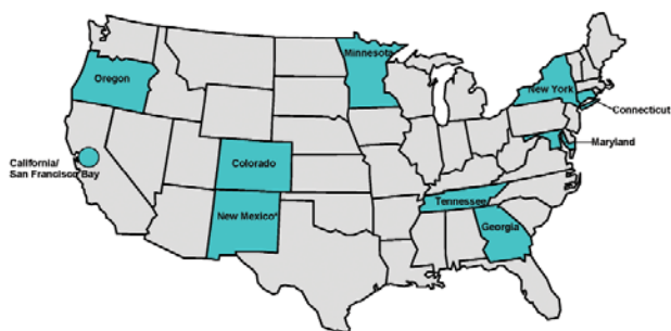
Figure 1. Distribution of Emerging Infections Programs (EIPs), a network of 10 state health departments and their collaborators in local health departments, academic institutions, and clinical settings, coordinated by the Centers for Disease Control and Prevention. *New Mexico was added as the 10th EIP site in late 2002 and will begin EIP activities during 2003.

agents, diseases transmitted through blood transfusions or products, vaccine development and use, diseases of pregnant women and newborns, diseases of persons with impaired host defenses, and diseases of travelers, immigrants, and refugees. We describe EIP accomplishments and future directions.