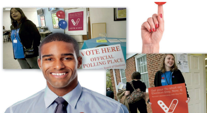
FIGURE 1. Vote & Vax participating immunizers (volunteers at the University of Maryland School of Pharmacy) with Vote & Vax promotional materials.